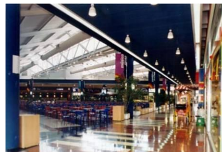
Shopping Centre Cordoba, Argentina 19.000m 2 , value USD$ 14,3 M Antonini Shon Zemborain