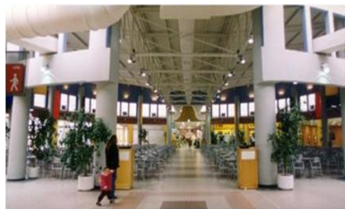
Shopping Centre Santiago del Estero, Argentina 20.400m 2 , value USD$ 15,3 M Antonini Shon Zemborain