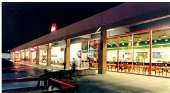
Shopping Centre Cordoba, Argentina 14.300m 2 , value USD$ 14,3 M Antonini Shon Zemborain